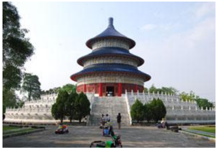
Wusanto Reservoir ( http://wusanto.magicnet.com.tw/ )