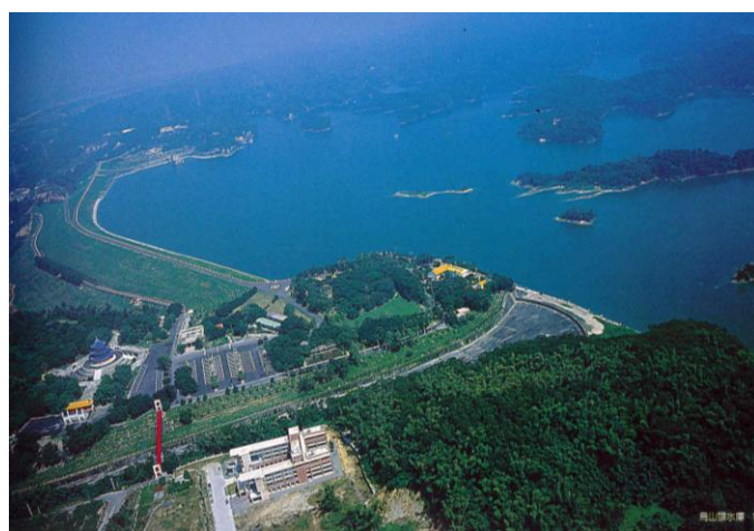
Wusanto Reservoir ( http://wusanto.magicnet.com.tw/ )